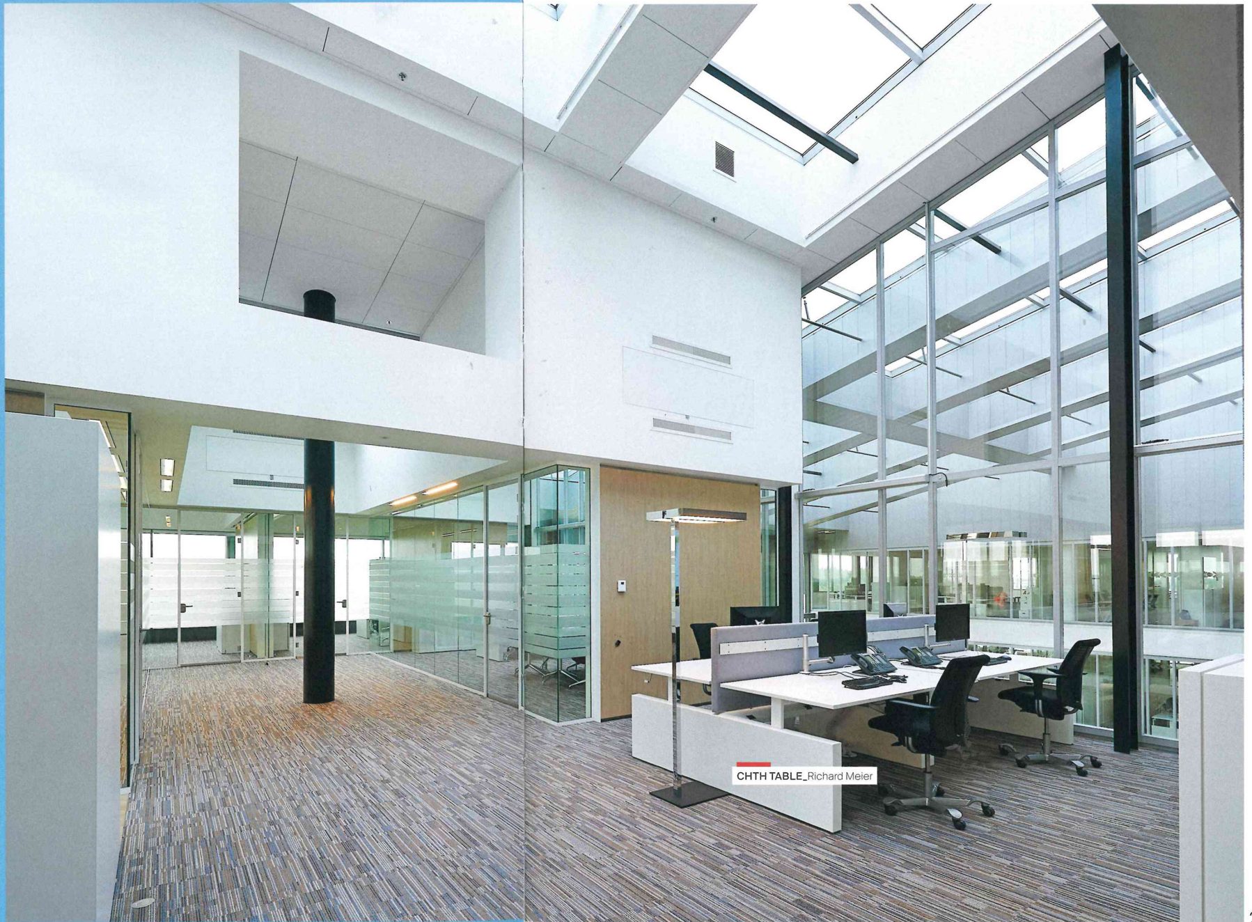
CHTH TABLE, Richard Meier